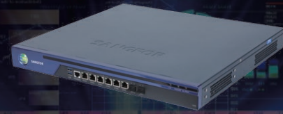
All Pictures shown are for illustration purpose only. Actual Product may vary.

IAG-M5200 is the ideal network management solution for Small & Medium Enterprises. It is also ideal for Branch Deployment.