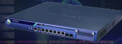
All Pictures shown are for illustration purpose only. Actual Product may vary.

IAG-M5800-SK is the ideal network management solution for Small & Medium Enterprises consists of heavy internet users and eliminate throughput bottleneck. It is also ideal for Branch Deployment.